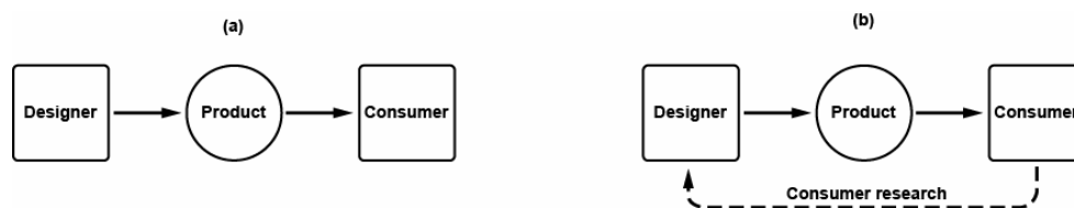
Figure 1. (a) Product form as a communicative media. (b) Consumer research as a flow of information to the designer [see Krippendorff and Butter 1984: 6]

The visual form of products has been described as a medium through which designers communicate with consumers [Krippendorff and Butter 1984; Monö 1997; Crilly et al., 2004]. This approach to product aesthetics views the product as a text that is 'written' by designers and 'read' by consumers. Designers are thus considered to have some intentions for how the product should be interpreted. These intentions are embodied in the product and the consumer responds to the product in a manner that may or may not correspond with the designers' original intentions. Representations of this perspective have typically implied that the designer-consumer relationship is essentially linear and uni-directional (see Figure 1a). However, in examining the nature of designer intent and consumer response it is important to consider the designers' awareness of consumers and the research that is conducted to acquire further knowledge about them (see Figure 1b).