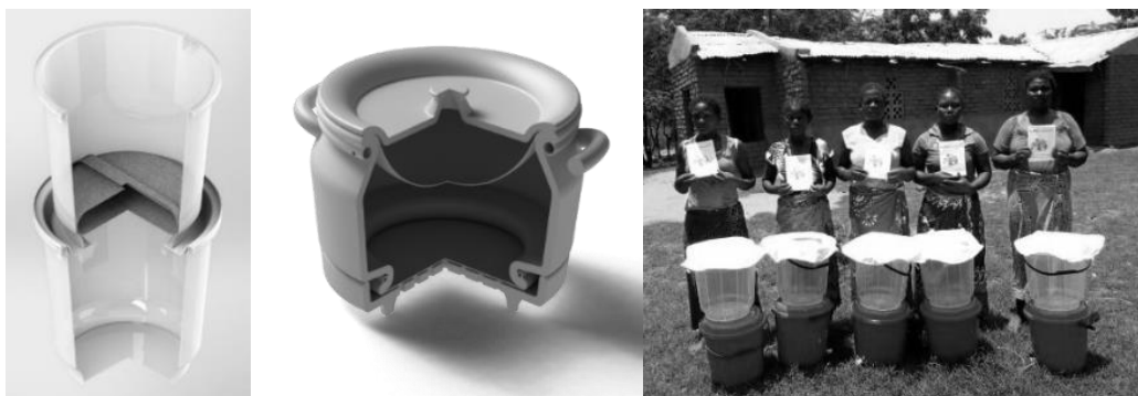
Figure 4-6. 4: Cut away view of the pillow filter design. 5: Cut away view of the pot filter design. 6: Chikwawan women receive SoDis buckets and fabric filters for initial testing