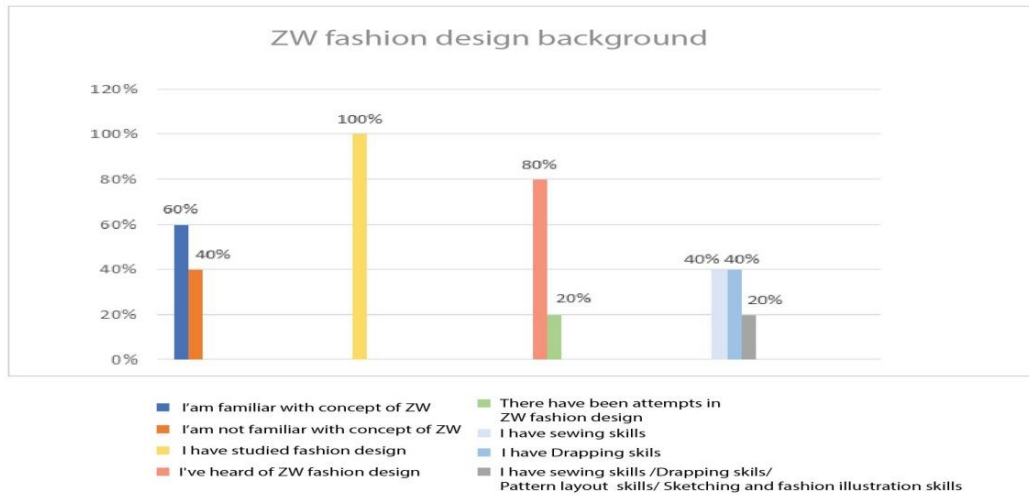
Figure 1. Survey summary by Zero Waste courses 2021, student's previous experience in fashion