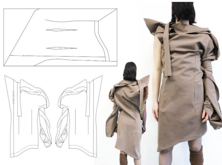
Figure 3. Kirke Talu MA 1 year student Art Academy of Estonia Fashion Design department 2021

The use of traditional clothing shapes, such as the Japanese version of the kimono, helps to organize the layout of the cutting areas owing to the potential for a clear and predictable result, such as silhouette, assortment and shape of the garment. The ability to react to changes at the stage of the design pattern development is of great importance in the process of completing the assignment, as shown by the analysis of the survey, 50% of students adjusted the silhouette of clothing to avoid having textile trimmings (Figure 3).