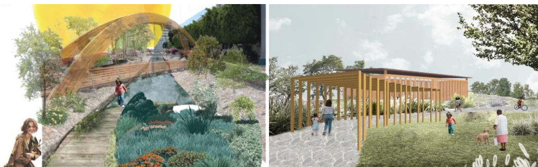
Figure 2. A-Puente and Women's plot concepts. Credit: CDR students cohorts

On this first occasion, 13 architecture and design students participated, which were subdivided into teams that focused on different areas of the campus. Teams are formed by affinity between peers or by topics of interest. Campus Vivo project resulted in a master plan and in three main interventions: 1) A-Puente , a concept that features an experiential path aimed to eradicate the fragmented space re-signifying "water as bridge and generator of life" and potentiate and diversify campus infrastructure into an opportunity to manage water positively. (See Figure 2); 2) Living Future Lab and Ethnobotanical Garden , a regenerative learning area within the campus featuring classrooms, a museum space, a plant conservatory, and parking lots surrounded by an ethnobotanical garden with the capacity to host, conserve, and integrate native plants as an edible forest; 3) Parque Flux , An open space for coexistence both interpersonally and with nature. In this way, connections between the campus and the city would be generated, becoming a point of exchange of knowledge and biodiversity.